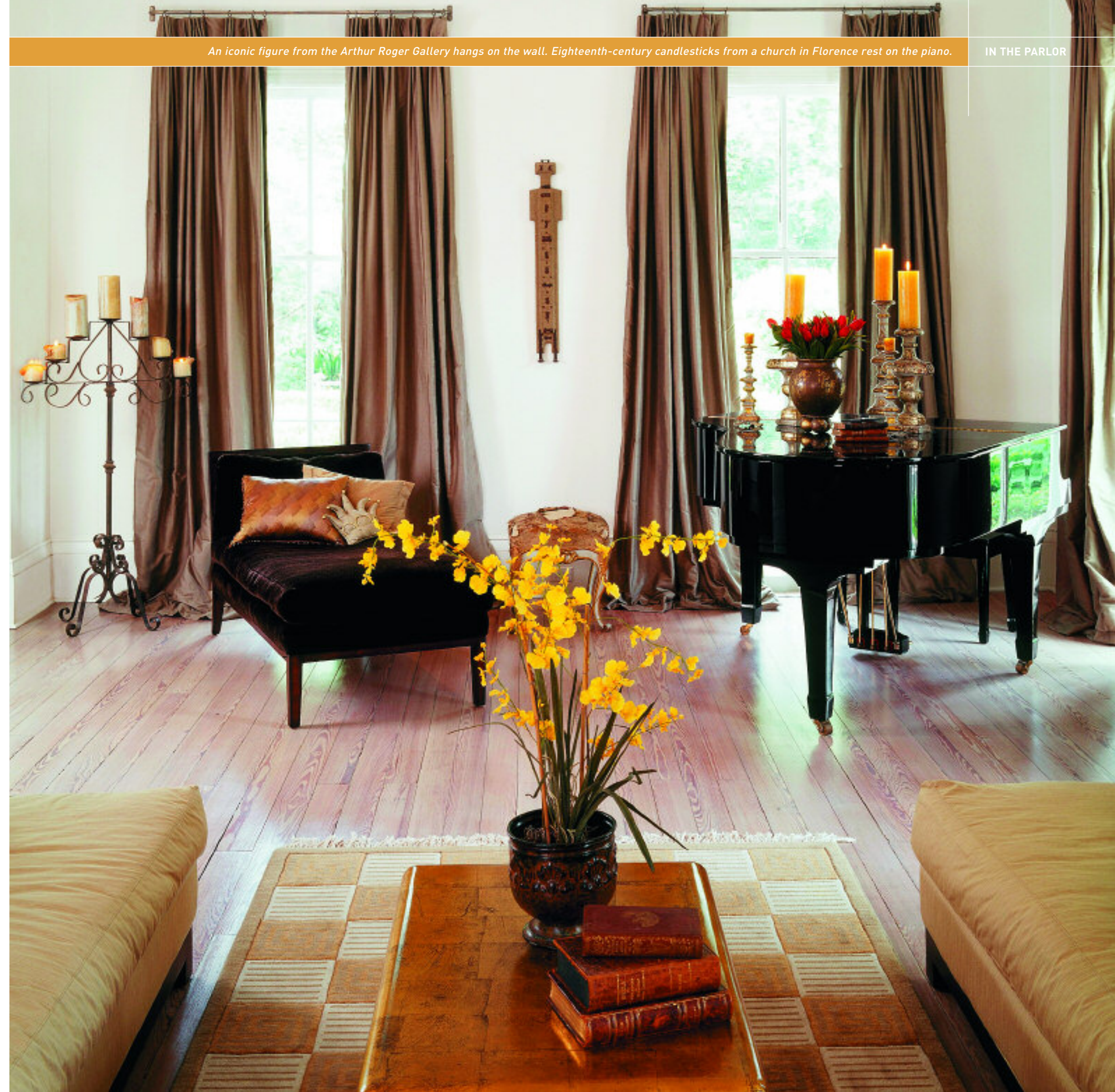
IN THE PARLOR