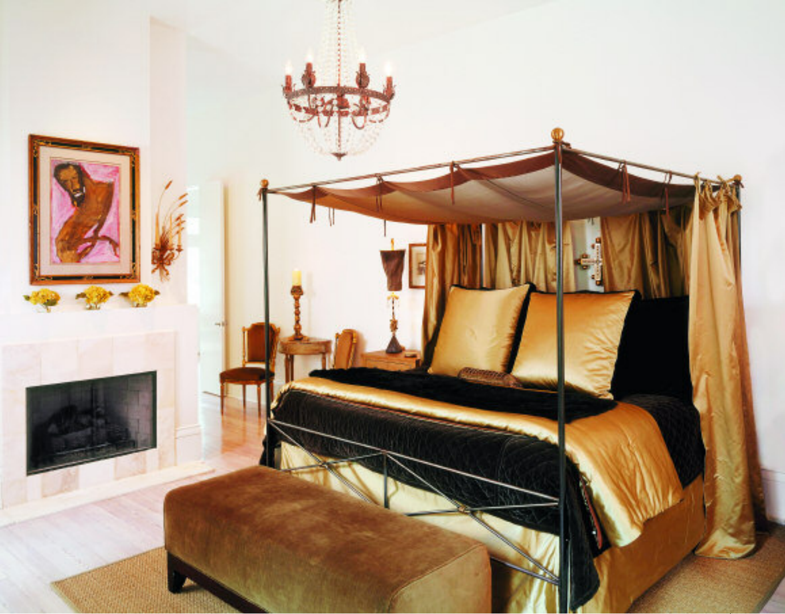
A SUMPTUOUS SILK AND VELVET BEDDING ENSEMBLE COMPLEMENT THE CUSTOM BED, ALL DESIGNED BY LEFTWICH. A PAINTING BY CHUCHO REYES HANGS ABOVE THE LIMESTONE FIREPLACE.