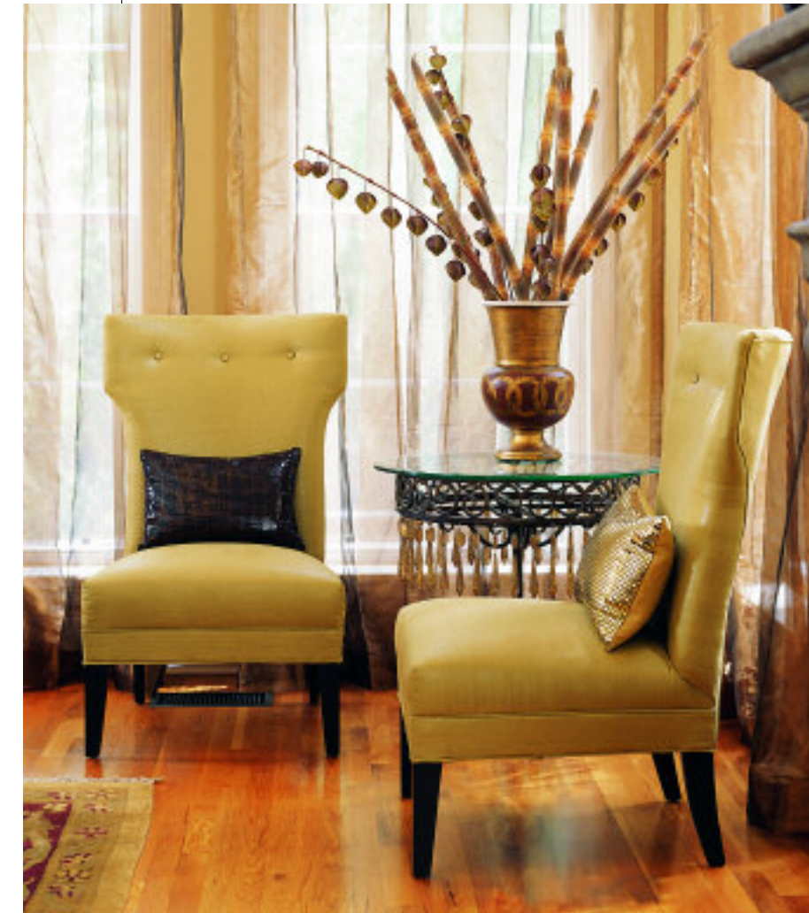
MITCHELL GOLD CURVED HIGH-BACK ACCENT CHAIRS ARE UPHOLSTERED IN WAXED LINEN. CUSTOM PILLOWS ARE BY DRANSFIELD & ROSS, AND GOLD SILK METALLIC DRAPES ARE FROM THE VILLA VICI CUSTOM COLLECTION.