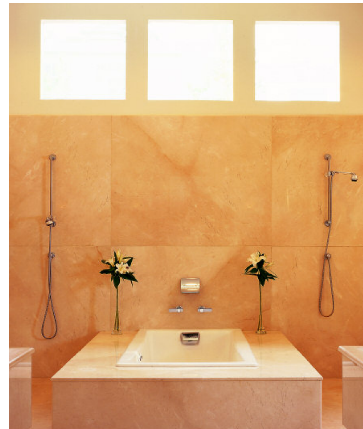
THE OPEN ROMAN-STYLE LIMESTONE HIS-AND-HER BATH IS AWASH IN LIGHT FROM THE TRIPLE SET OF WINDOWS ABOVE.